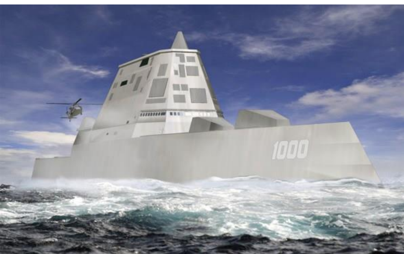
C3I's ACCS® software and hardware are controlling/communicating with 9 individual systems onboard DDG 1000