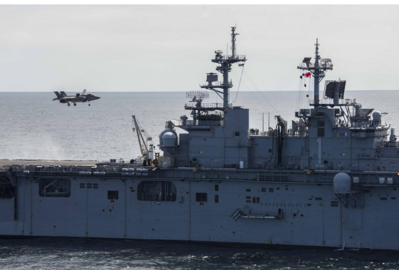
An F-35B aircraft landing onboard the USS Wasp (LHD 1) during evaluation testing – C3I's ALS-CPS system successfully controlled LED lighting during the at-sea testing evolution