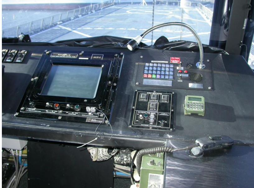
Command and Control of Flight Deck systems onboard the USS Sea Fighter (FSF 1) including Night Vision Compatible displays for NVIS operations