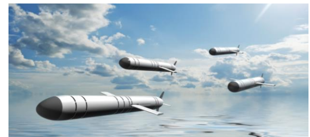
RF Homing Seekers