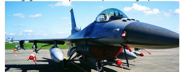
Test launched from front-line US Aircraft

Should an enemy strive to complicate the battlefield by stray or competitive RF energy, SARA's HOJ subsystems can enable a host guided bomb or missile to engage it as the system or operator might prefer.