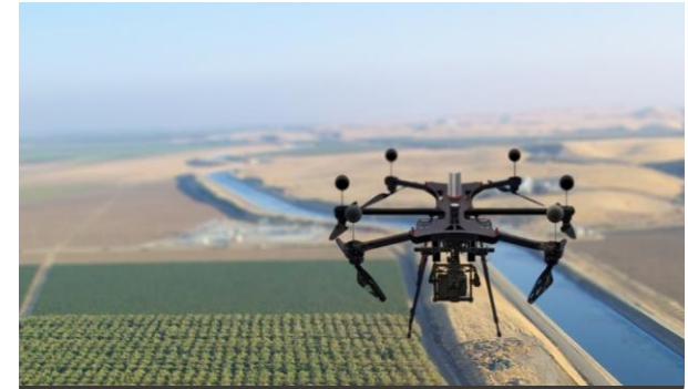
Detect & Avoid for UAS