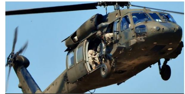
Hostile Fire Warning