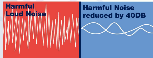
Hearing Armor Filter

The Hearing Armor design permits sound to enter the earplug. A proprietary diaphragm embedded inside significantly reduces dangerous sounds and blocks their damaging shock waves, while quiet sounds are minimally affected. Hearing Armor achieves these results without any moving parts or electronics. Independent testing indicates that Hearing Armor reduces impact noise of 140 decibels by over 40 decibels. Wearing Hearing Armor earplugs will allow warfighters to be combat ready at all times while still maintaining their situational awareness.