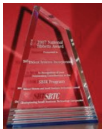
Tibbetts Award for Small Business Innovation Research