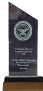
NAVSEA Value Engineering Award