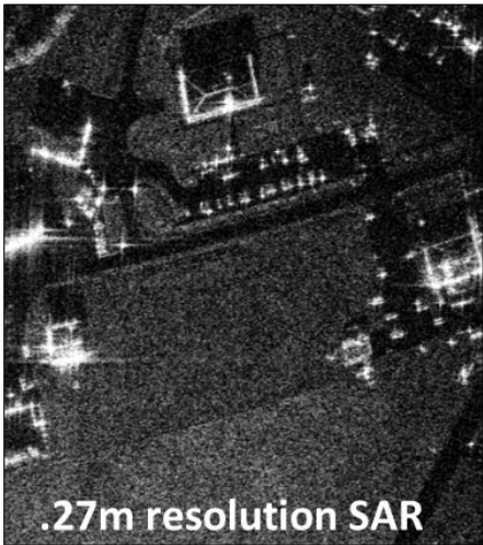
.27m resolution SAR