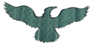
Washington Navy Yard Campus Renovation Award