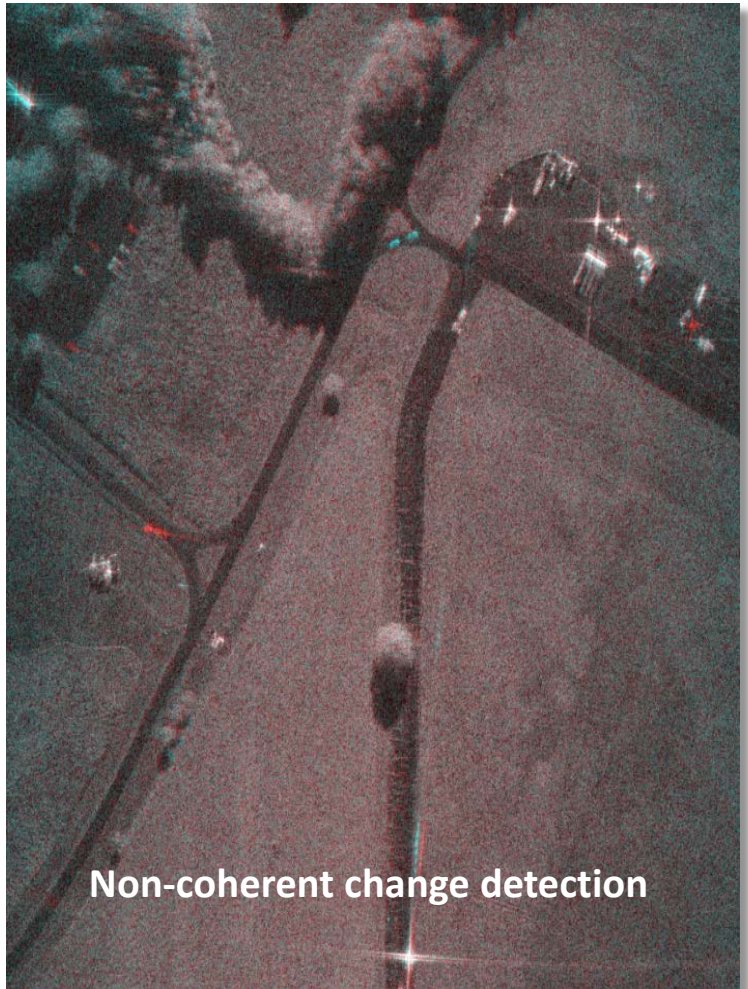
Non-coherent change detection

Trident's experienced engineering staff offers many decades of expertise across a broad range of engineering disciplines, including advanced signal processing, RF, data conversion, FPGA-based hardware design, real-time embedded firmware and software, and mechanical packaging, with particular expertise in small form-factor, conduction-cooled, high performance programmable RF systems. RS has developed compact high-performance digital systems for smallsats, airborne use on small UAVs, and other applications where volume, weight, and power are at a premium.