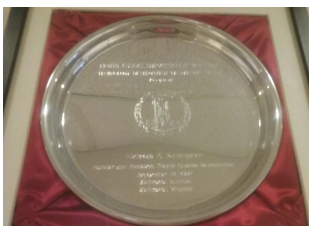
Virginia Technology Development Award