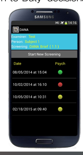
Sample DANA results screen

Warfighters' cognitive and psychological functioning cannot currently be assessed when forward deployed. DANA™, an FDA-cleared neurocognitive assessment tool running as an application on mobile devices, addresses that gap. DANA can be used to assist in making critical "Fit-for-Duty" and "Return-to-Duty" decisions.