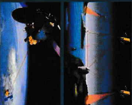
Free space optical (FSO) link enabled with EO laser beam steering tracking.