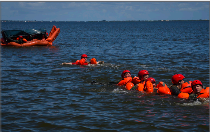
Photo courtesy USAF 180804-F-CV286-067.jpg Vastly improved inflatable LPUs and life rafts are being developed by Kennon for NAVAIR (SBIR project).