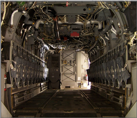
An executive-level VIP cabin liner kit was developed and produced by Kennon for the HMX-1 fleet of V-22 support aircraft (SBIR project)