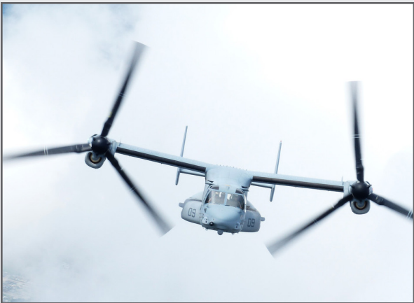
Kennon's R&D group is developing next-generation lightweight armor systems for the V-22 Osprey (SBIR project).