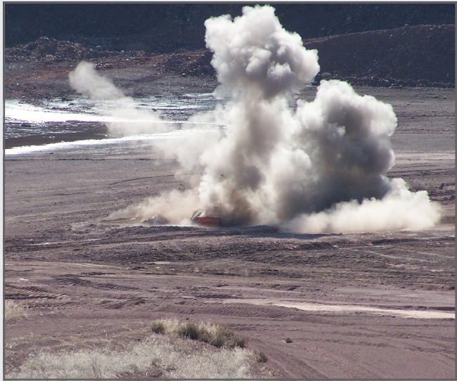
Blast testing was performed by Kennon to measure the performance of IED armor developed for ONR (STTR project).