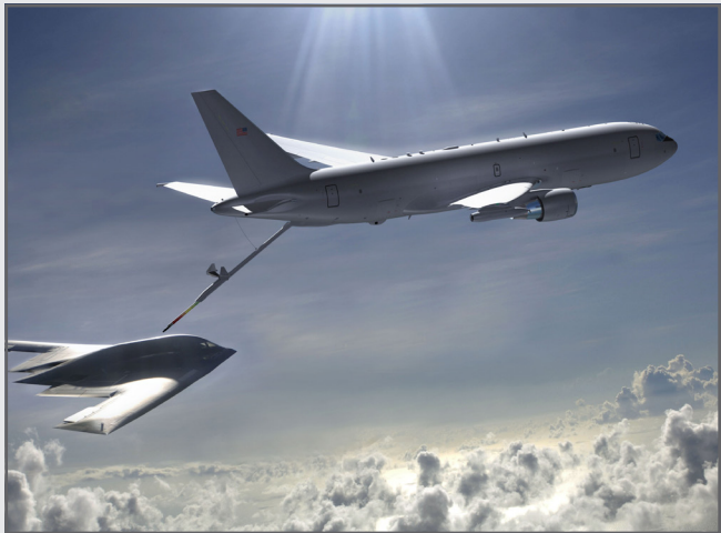
Kennon is currently under contract to develop radiation shields for the Air Force's new KC-46 Pegasus tanker.