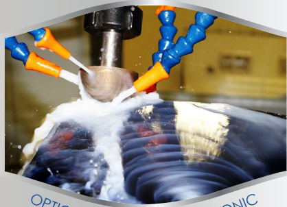
OPTICAL GRINDING / ULTRASONIC