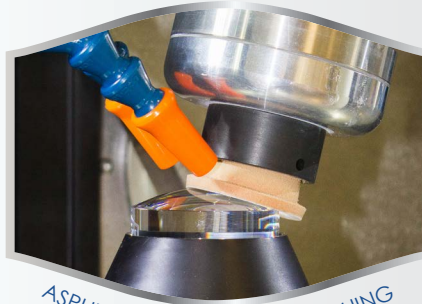
ASPHERIC & FREEFORM SMOOTHING