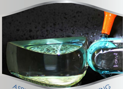
ASPHERIC & FREEFORM POLISHING