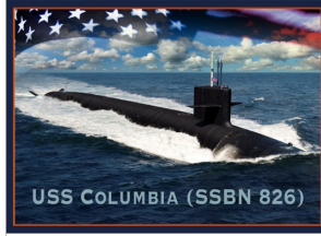
Image Citation: Image courtesy of Mosaic Materials, Inc., Copyright 2019. (left); Naval Sea Systems Command Image (161214-N-LV331-001), available at: https://www.navy.mil/view_image.asp?id=229917&t=1