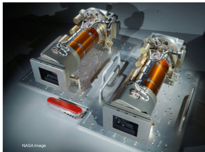
The twin Mastcam-Z cameras, shown with a pocket knife for scale,

There were some real challenges associated with making each of these systems, Spilman said. "The Mastcam-Z system has very tight tolerances on all the lens components, tolerances that are very much out of the ordinary for most optics manufacturing companies. Through our Navy SBIR projects, we were focused on grinding and polishing, developing processes with different types of materials and exotic shapes, and also metrology systems. Those Navy projects