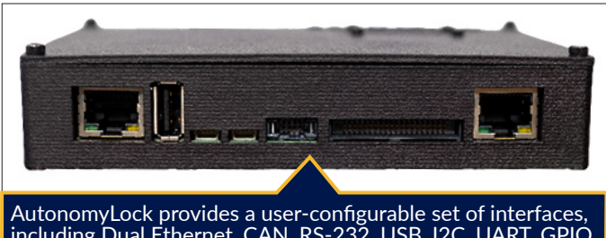
AutonomyLock provides a user-configurable set of interfaces, including Dual Ethernet, CAN, RS-232, USB, I2C, UART, GPIO and PWM. Secmation also offers options to integrate custom hardware.

AutonomyLock is based on Secmation's Secure Modular Aerial Unmanned System (SecMUAS), an Office of Naval Research (ONR)-funded SBIR project that began in 2019. The goal of ONR's SBIR topic was to enable faster development of Navy uncrewed aerial platforms, specifically Group 1 and Group 2 small UAS. UAS have become an essential part of U.S. military operations, providing combat support and