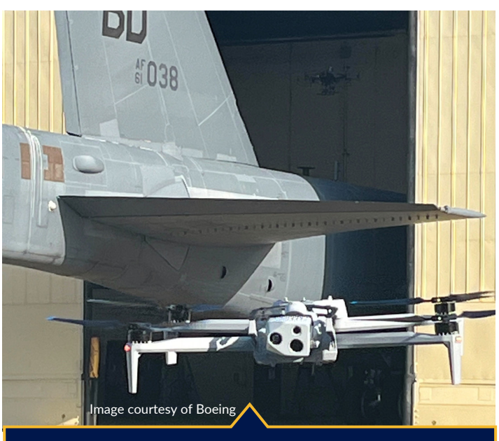
Scanning unmanned aerial systems are designed for ease of use even if the operator has no previous drone experience.

to identify surface skin anomalies from drone photos of aircraft called Automated Damage Detection System (ADDS). BGS has partnered with multiple different small businesses to provide drone operations in demonstrations for the Department of Defense. More details are available in an article available at the following link: https:// www.307bw.afrc.af.mil/ News/Article-Display/ Article/3848122/307thbomb-wing-jets-getinnovative-treatment/.